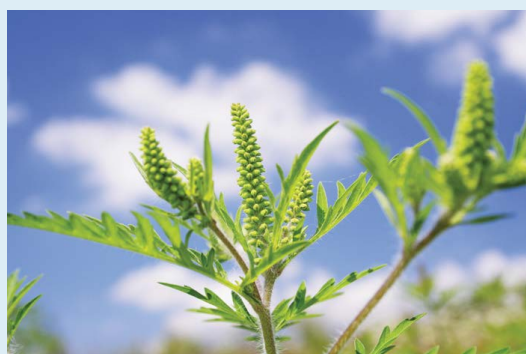
A photo of a ragweed plant, a common source of allergens in Missouri. Like many crops and pollen sources, ragweed will have a longer growing season as temperatures rise. Stock photo.

Climate change may also increase the length and severity of the pollen season for allergy sufferers. For example, the ragweed season in Kansas City has grown 18 days longer since 1995, because the first frost in fall is later.