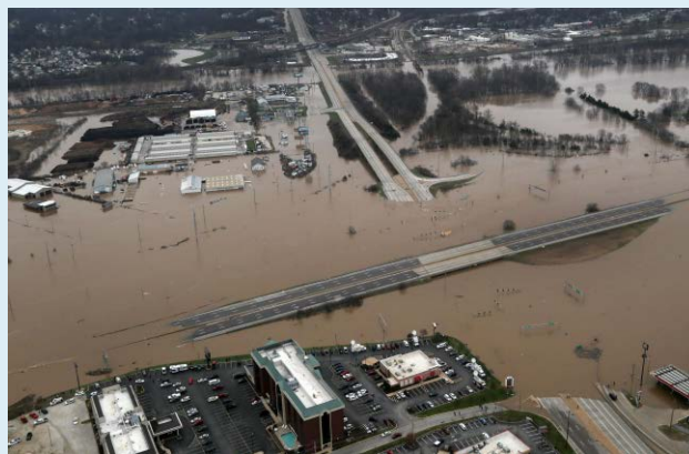
Heavy rain led to flooding around St. Louis in December 2015, including this area in Valley Park.

Flooding occasionally threatens navigation and riverfront communities, and greater river flows could increase these threats. In April and May 2011, a combination of heavy rainfall and melting snow caused a flood that closed the Mississippi River to navigation, threatened Caruthersville, and prompted evacuation of Cairo, Illinois, due to concerns that its flood protection levees might fail. To protect Cairo, the U.S. Army Corps of Engineers opened the Birds Point-New Madrid Floodway, which lowered the river by flooding more than 100,000 acres of farmland in Missouri. Later that spring, heavy rains and rapid snowmelt upstream led to flooding along the Missouri River, which damaged property and closed the river to navigation.