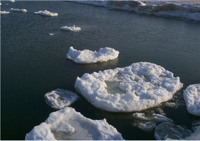
Ice forming on Lake Michigan near St. Joseph.