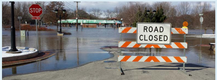
Heavy rains and snowmelt flooded the Tittabawassee River in Midland in April 2015.

Changing the climate is likely to increase the frequency of floods in Michigan. Over the last half century, average annual precipitation in most of the Midwest has increased by 5 to 10 percent. But rainfall during the four wettest days of the year has increased about 35 percent. During the next century, spring rainfall and annual precipitation are likely to increase, and severe rainstorms are likely to intensify. Each of these factors will tend to further increase the risk of flooding.