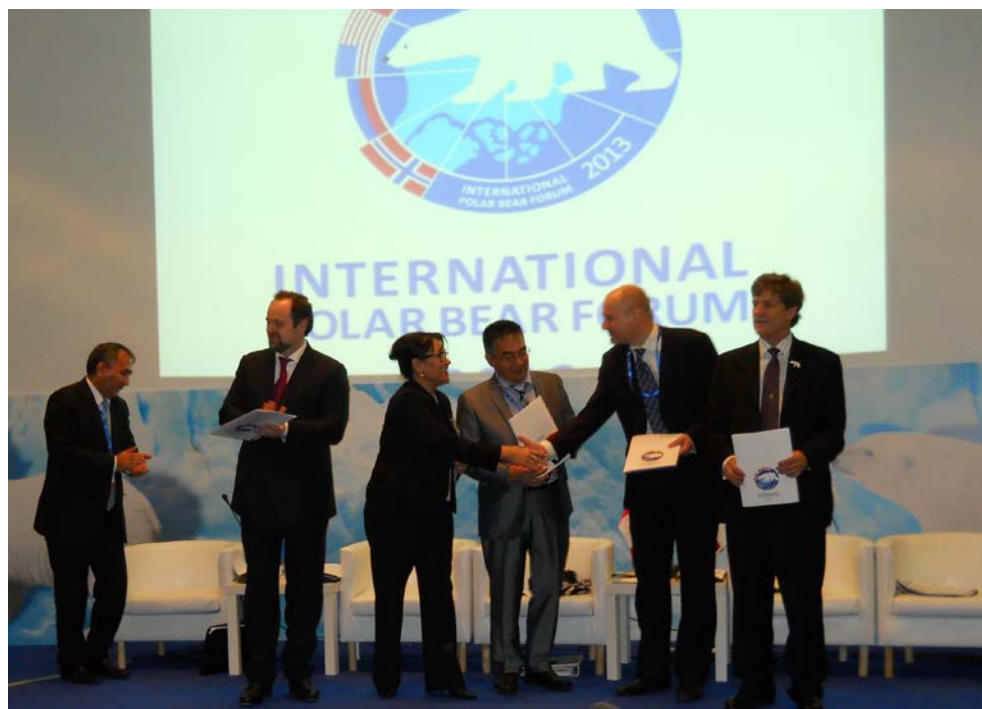
Representatives of Russia, Canada, Greenland (Denmark), Norway, and the United States commemorate the 40 th Anniversary of the 1973 Agreement on the Conservation of Polar Bears in Moscow.

PURPOSE: Promote research on the biology and ecology of polar bears, and coordinate implementation of the U.S.-Russia Agreement on the Conservation and Management of the Alaska-Chukotka Polar Bear Population (2000).