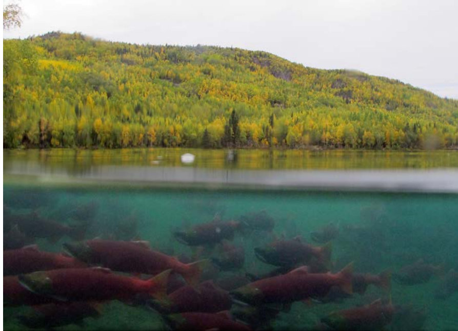
Sockeye salmon swimming upstream