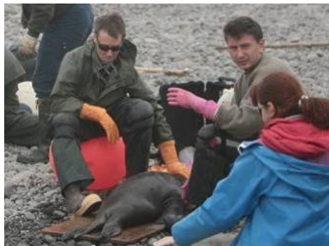
Measuring a sea lion pup in the Kuril Islands