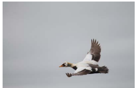
Right: Migrating spectacled eider

1. American, Russian and Japanese specialists will meet in Tokyo in early December 2013 in the fifth of an ongoing series of periodic meetings to discuss migratory bird topics of mutual concern to the three countries. (FWS, ASC; MNRE, BBRC)