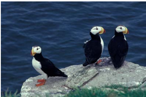
Left: Trio of horned puffins

PURPOSE: Coordinate implementation of the 1976 bilateral Convention between the United States and U.S.S.R. (Russia) and promote the conservation and study of the more than 200 avian species listed in the Appendix to the Convention.