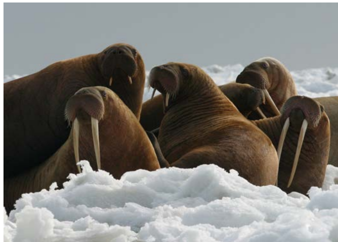
Pacific walrus on an ice floe