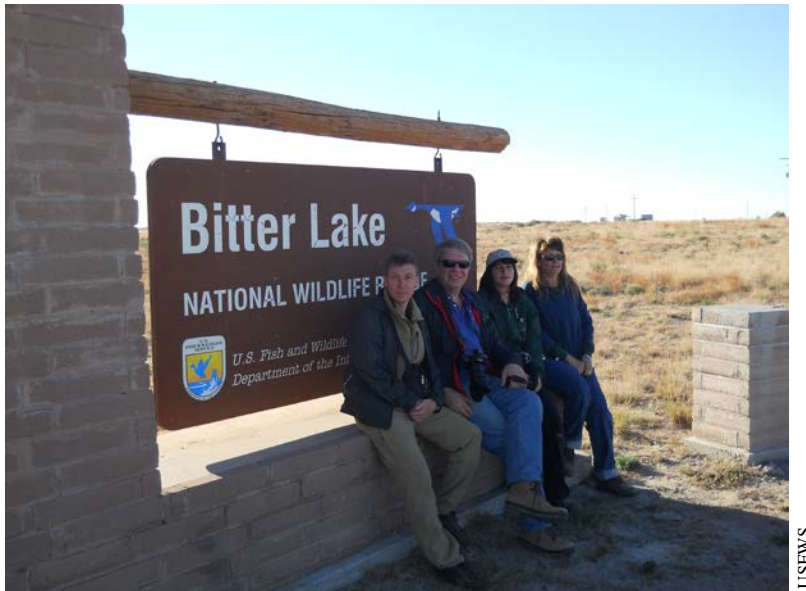
Russian botanists at Bitter Lake National Wildlife Refuge learn about threatened and endangered plants in arid ecosystems of the Southwest United States.