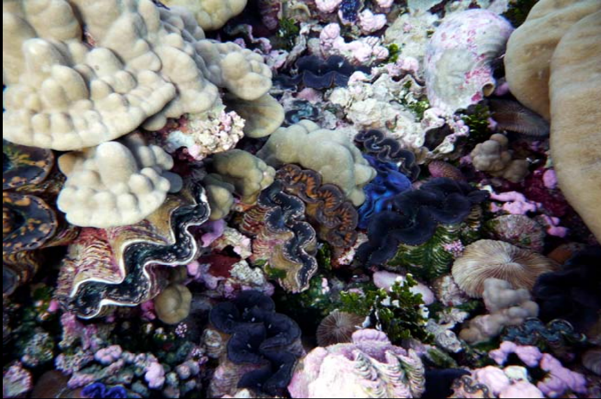
Clam gardens.