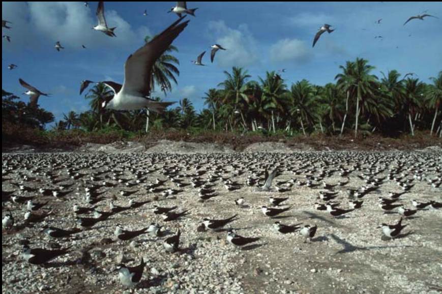
Sooty terns.