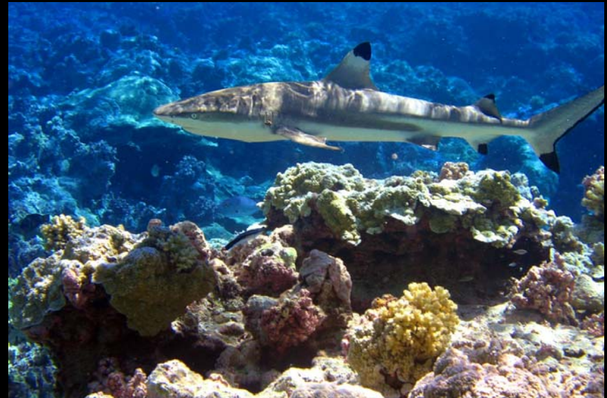
Black tipped reef shark.