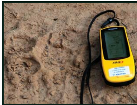
Using GPS to map tiger activity at Thap Lan NP