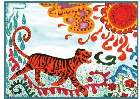
Art contests raise awareness among young people in Southeast Asia

To help build support for tiger conservation among young people, over 200 teachers have brought interactive tiger education into the classroom by emphasizing learning dramas, games, academic debates, art contests (see image at right), mapping exercises, and mock conferences. As a result, this innovative conservation program is being adopted by schools in the vicinity of tiger habitat in India, Bangladesh, and Russia.