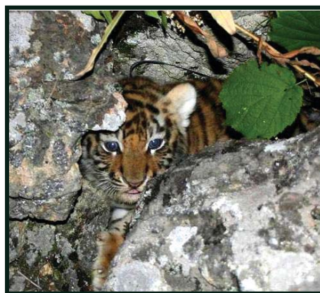
Siberian tiger cub ( Panthera tigris altaica)

Researchers have confirmed viable Siberian tiger habitat exists on both sides of the Russia-China border. However, until recently, tigers were largely restricted to the Russian side where they were less likely to encounter poachers. Wildlife Without Borders has supported removal of snares in China, use of advanced patrol techniques, as well as outreach to local communities on tiger conservation. As the impact of illegal hunting decreases, and new parks are established to protect Siberian tigers, their population is expected to grow and expand (see image below).