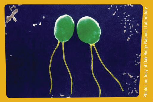
Microscopic in size, individual algal cells like the ones above can reproduce in a matter of hours.

Because the Ames Lab nanospheres are just billionths of a meter wide, they can only be seen close up with an electron microscope. The spheres' golf-ball-like outer texture increases their available surface area, which allows them to extract more oil from algae cells. The oil is later converted into biodiesel fuel.