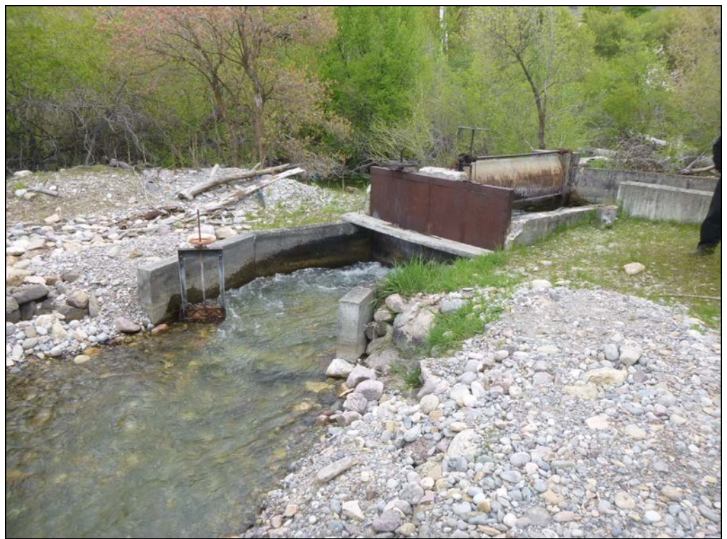
Photograph No. 3.1