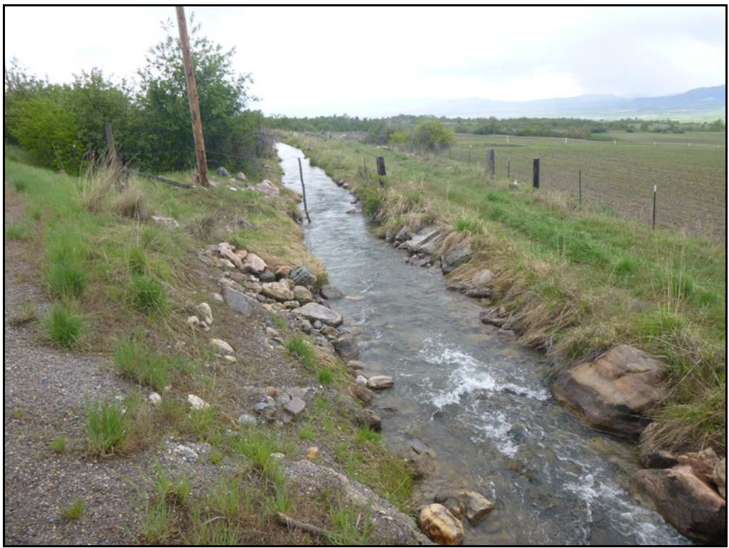
Photograph No. 3.3

Noxious weeds are plants that typically invade from other countries, leaving their natural controls and competitors behind (insects, diseases, grazers, and climate). They have adapted to grow and proliferate in human-disturbed areas.