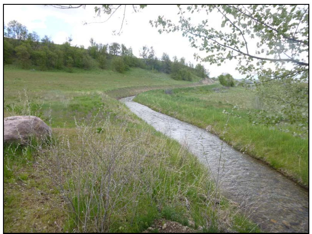
Photograph No. 3.2