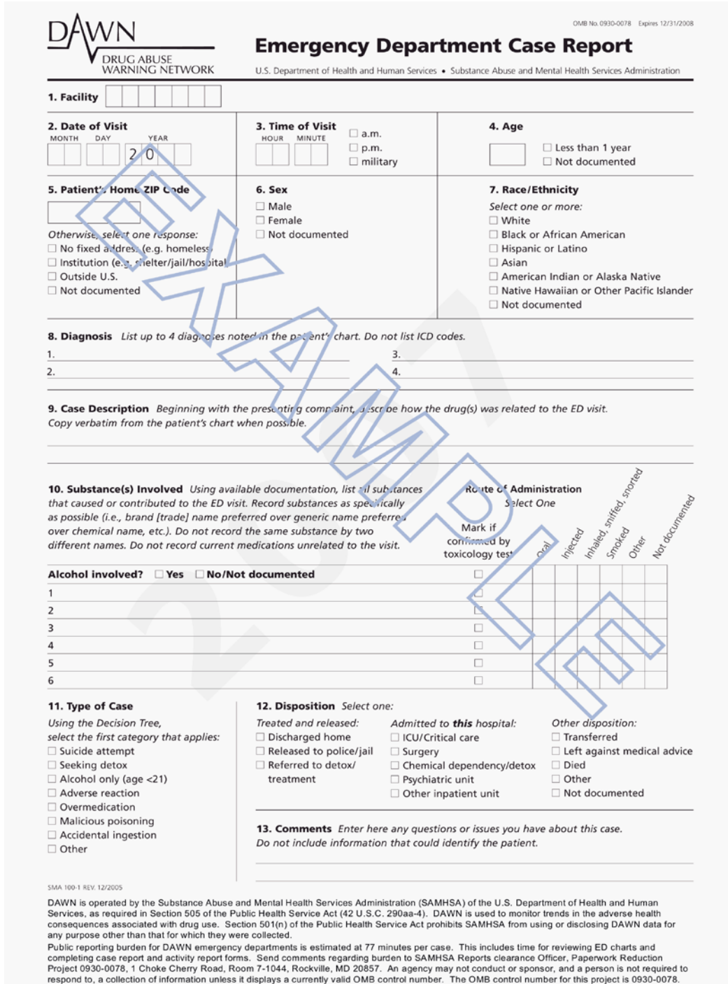
Figure 2. DAWN ED case form

Figure 2 depicts the data items collected by DAWN. Additional detail on key items is provided in the following sections.