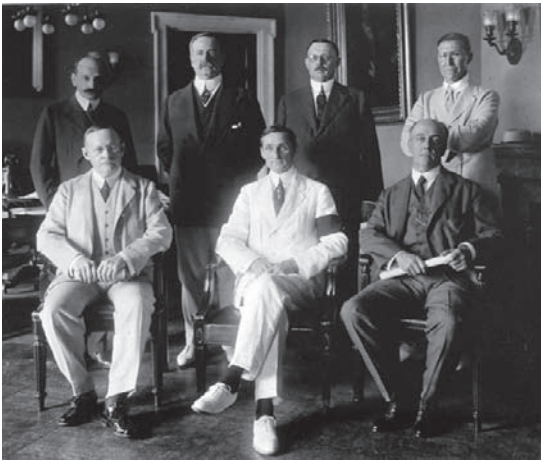
The first Federal Reserve Board, 1914

The Board of Governors of the Federal Reserve System is a federal government agency. The Board is composed of seven members, who are appointed by the President of the United States and confirmed by the U.S. Senate. The full term of a Board member is fourteen years, and the appointments are staggered so that one term expires on January 31 of each even-numbered year. After serving a full term, a Board member may not be reappointed. If a member leaves the Board before his or her term expires, however, the person appointed and confirmed to serve the remainder of the term may later be reappointed to a full term.