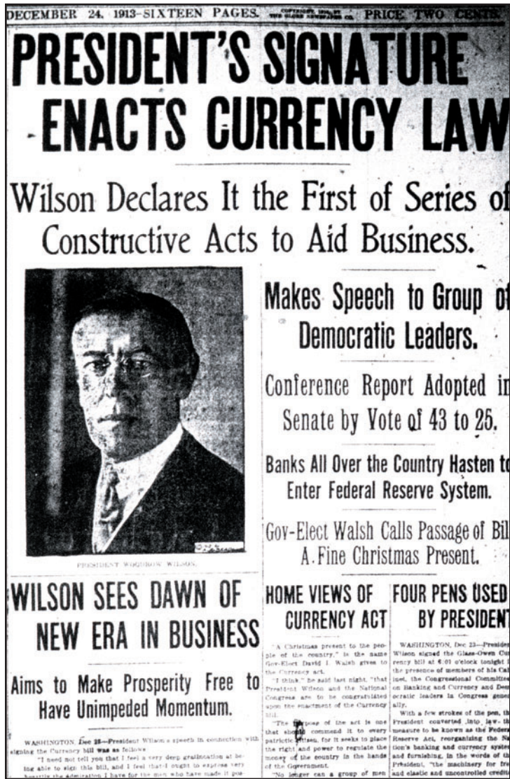
President Wilson signed the Federal Reserve Act on December 23, 1913.

The Federal Reserve System is considered to be an independent central bank because its decisions do not have to be ratified by the President or