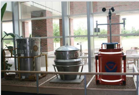
"Dorothy" and "D.O.T.3" which appeared in the movie "Twister" are on loan from Warner Brothers.

Today we have instruments that are smaller and easier to deploy in large numbers to sample tornadoes. Tornado PODs are 1-meter tall towers of instruments with a flat base to measure wind velocity and direction at the ground level. StickNets are 2-meter tall tripods designed to collect complete wind data sets and atmospheric variables. Setting these instruments in a large array increases the chances one will be hit by a tornado. On June 5, 2009 in southeast Wyoming, a tornado did pass over one of the StickNet arrays collecting valuable data during the Verification of the Origins of Rotation in Tornadoes Experiment (VORTEX2) 2009-2010.