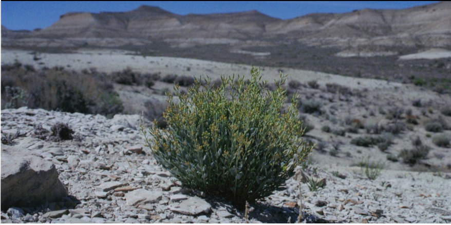
Shrubby reed-mustard in white shale habitat

that are likely to be mined in the foreseeable future—oil shale production at one site in the Uinta Basin is planned to begin in 2012. Small population size also remains a concern for this species, as we currently estimate only about 3,000 of these plants exist.