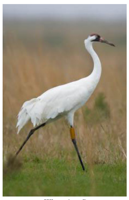
Whooping Crane

The states of Wyoming, Colorado, and Nebraska, and the U.S. Department of Interior are