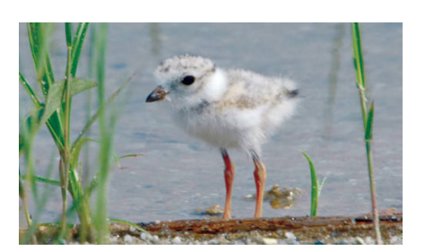
Piping plover chick