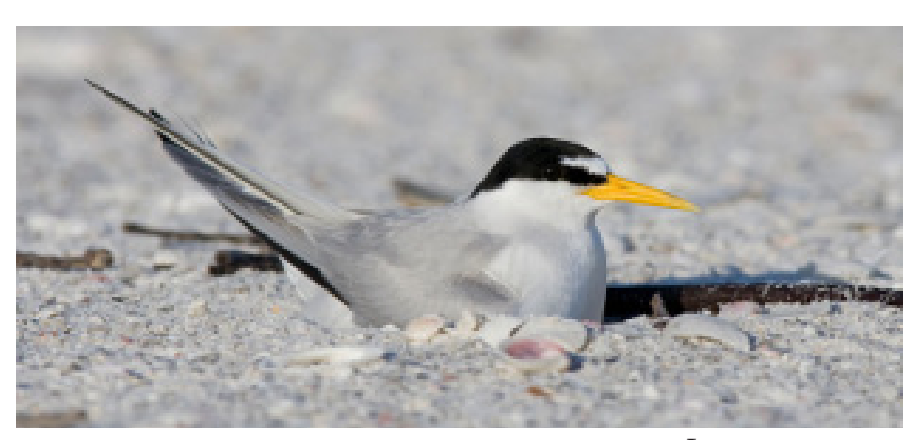
Least\ stern