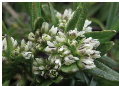
Mosquito Range mustard close-up