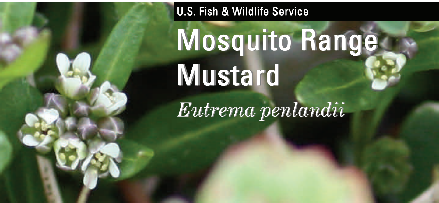
Mosquito Range mustard

When Congress passed the Endangered Species Act (ESA) in 1973, it recognized that many of our nation's native plants and animals were in danger of becoming extinct. The U.S. Fish and Wildlife Service administers the ESA to preserve these imperiled species and their habitats for future generations.