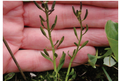
Mosquito Range mustard fruits

Western Colorado Field Office 764 Horizon Drive Grand Junction, CO 81506 (970) 243-2778 http://www.fws.gov/coloradoes