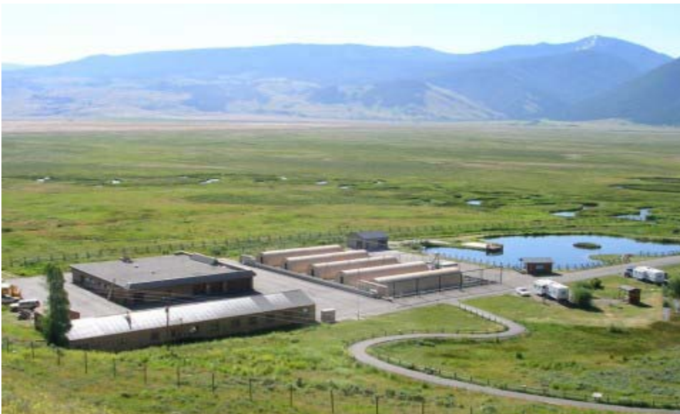
Jackson National Fish Hatchery, Jackson, Wyoming.