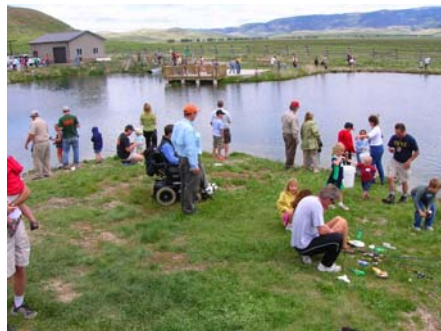
Kid's Fishing Day is held each June.

Join the hatchery staff each June as they kick off National Fishing and Boating Week with a free Kid's Fishing Day. The event, for children under the age of 14, is fun and educational. Food, poles, prizes and much more are included in the festivities. You won't want to miss it!