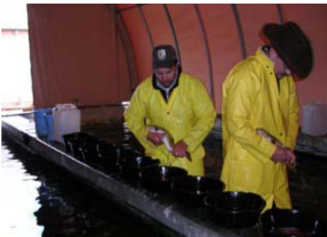
Spawning season at Jackson NFH occurs in the spring and early summer.

Broodstock are adult fish that produce eggs and sperm (or milt). A broodstock hatchery specializes in rearing fish to adult size, then taking eggs from the females and fertilizing them with sperm from the males. After incubating the eggs through the fragile early stages, they are either shipped to other hatcheries or raised to stockable sizes.