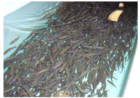
A tank full of small fish (above), and a Snake River Cutthroat Trout (below).