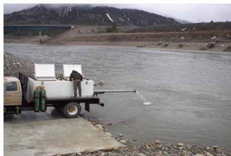
Stocking waters for Palisades Reservoir, Idaho.

The role of the National Fish Hatchery System has changed and diversified greatly over the past 30 years as increasing demands are placed upon aquatic systems. In recent years, the Service has maximized the output of its work force by integrating the work of fish hatcheries and fisheries management. This integrated effort has resulted in cohesive, more efficient national restoration programs.