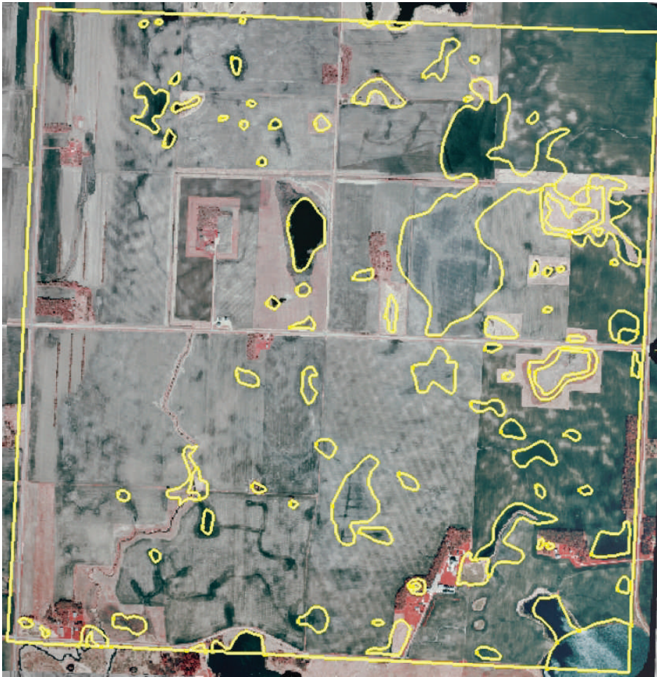
Figure 2. National Wetlands Inventory (NWI) data overlaid on aerial photographs allowed for detection of altered wetlands. Lines displayed show where wetlands were on the landscape during the mapping process in 1980 (circa 2006).

Although this assessment indicated that wetland changes throughout the entire Minnesota PPR were relatively small (−4.3% of total area) over nearly a 30-y span, data for some regions are more outdated than others, which should be a consideration when prioritizing remapping efforts. For example, net change ranged from 8 to 15% for ES in west-central and southern Minnesota. Remapping wetlands in these regions may be a high priority for conservation partnerships in the state. We believe that most losses can be attributed to fixing or