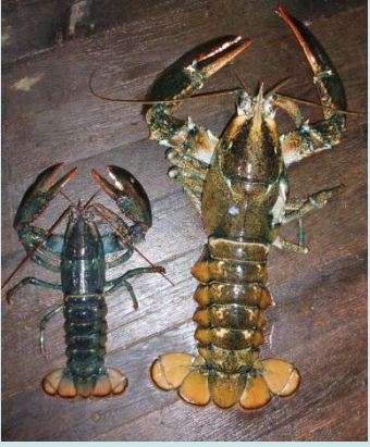
Anne Richards, NEFSC/NOAA

Visit our website to view observer logs, manuals and protocols: www.nefsc.noaa.gov/fsb/