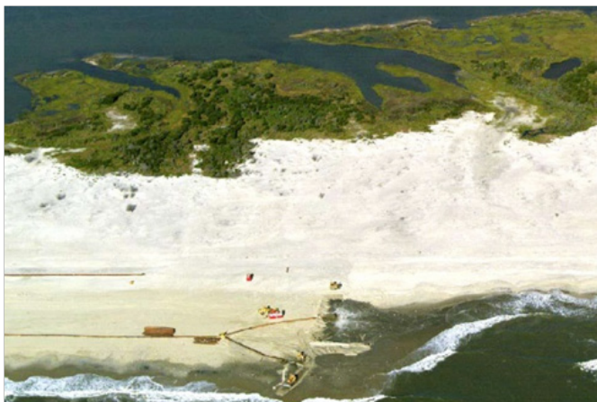
Figure 8.6. Beach nourishment at Assateague Island National Seashore in 2002 added sediment and widened the beach.

Beach nourishment, also referred to as renourishment or replenishment, is the placement of sand onto beaches or within the nearshore (figure 8.6). Sand is obtained from an outside source; it is commonly dredged from an offshore location and pumped via pipelines directly onto the beach or dumped from a hopper dredge into the nearshore, or in some cases it is trucked from an inland source and dumped onto the lower beach. Nourishment replaces sand that is lost because of coastal erosion and can temporarily widen a narrow beach. Many times this process is used to mitigate erosion caused by hard structures such as groins and seawalls. The placement of sand on the beach increases the distance between vulnerable infrastructure and wave energy, which in some cases can help mitigate and postpone damage to infrastructure and property from coastal hazards. Berms may also be built when sand is added to replace dune function; they absorb wave energy before the water reaches infrastructure behind the dunes, and they serve as a sand source to nourish the beach. Dunes may be stabilized by planting vegetation and erecting sand fencing, which is described in the following section. The NPS Reference Manual 39-2: Beach Nourishment Guidance provides guidelines and best management practices for implementing beach nourishment projects where they have been deemed necessary and consistent with NPS management policies (Dallas, Eshleman, and Beavers 2012).