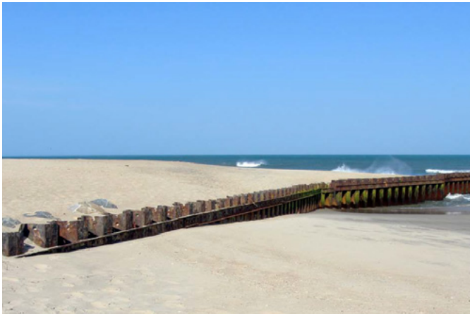
Figure 8.5. Steel sheet-pile groin at the former location of the Cape Hatteras Lighthouse.

Examples of jetty and groin projects are summarized below with cost estimates and project details. Both NPS and non-NPS examples are included.