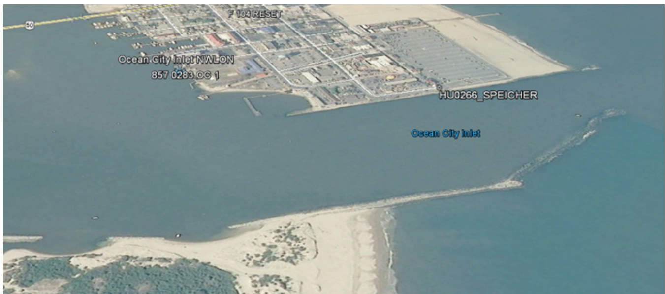
Figure 8.4. Ocean City Inlet jetty and breakwaters on the north end of Assateague Island National Seashore in 2011.

The cost of groin construction, repair, and replacement generally ranges from $250 to $6,500 per linear ft ($820 to $21,325 per m) depending on the material used (NCCRC 2010). Jetties tend to be more expensive, reaching up to $16,000 per linear ft ($52,495 per m). Jetties require maintenance, such as elevating the jetty height and extending the downdrift jetty inland