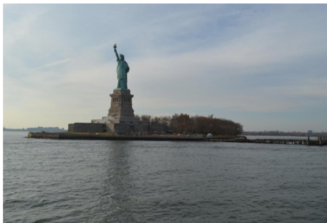
Figure 8.3B. Bulkheads protect Liberty Island.