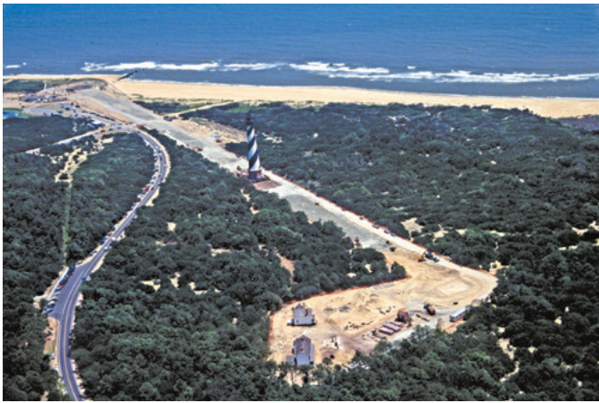
Figure 8.10. In this example of relocation and retreat, the Cape Hatteras lighthouse was moved inland using a railway.