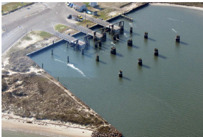
Figure 8.3A. Bulkheads at the Hatteras Island ferry landing on Ocracoke Island, NC.

The construction costs for shore-parallel engineering structures vary widely depending on factors such as material, height, land characteristics, and location. Total planning and installation is commonly around $2,000 to $3,000 per linear ft ($6,500 to $9,800 per m) but has topped $10,000 per linear ft ($32,800 per m) in several projects. Repair and replacement of deteriorating seawalls, revetments, and bulkheads can be more expensive than new construction. Examples from within and outside the National Park Service are compiled here.