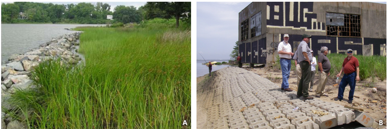
Figure 8.7. Examples of hybrid approaches to living shorelines. Notes: (a) This hybrid approach to a living shoreline uses natural and nature-based features by combining a planted marsh with a rock sill. (b) The vegetation component of this hybrid approach at GATE was unsuccessful, leaving only shoreline armoring.

NOAA Fisheries Office of Habitat Conservation provides guidance for living shoreline planning and implementation , including a diagram (figure 8.8) showing a continuum of treatment options (NOAA 2016); other good sources are Benoit et al. (2007) and the Maryland Chesapeake Bay experience over the past decades (Maryland Department