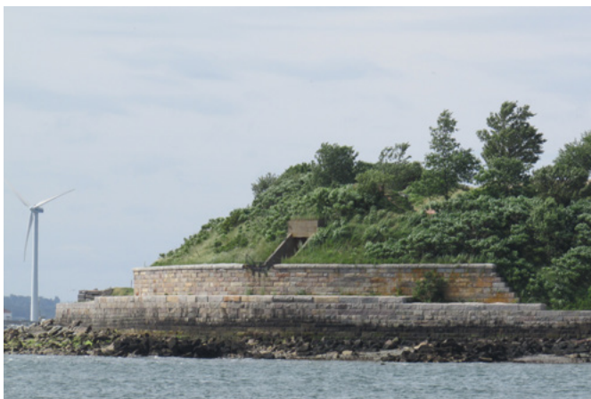
Figure 8.2. A seawall protects Fort Warren on Georges Island at Boston Harbor Islands National Recreation Area.

Revetments are placed directly on an existing slope, embankment, or dike to protect the upslope area from waves and strong currents, sometimes at the expense of the downslope area. They are commonly built to preserve the existing uses of the shoreline and to protect the slope. Like seawalls, revetments armor and protect the land and structure behind them. Revetments are commonly constructed using armorstone (in high wave energy environments), articulated concrete mattress (on riverbanks and in low and intermediate wave environments) (Leidersdorf, Gadd, and McDougal 1989), or rip-rap stone (in lower wave energy environments) in combination with smaller stone and geotextile fabrics. Other construction materials include gabions, placed concrete (usually in stepped fashion), pre-cast concrete blocks, and grout-filled bags.