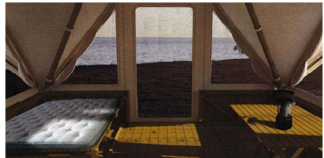
Figure 8.9. Visitor facilities have been redesigned at Everglades National Park; the new eco-tents are designed to be portable and can be moved in advance of storms.

Pilings used to elevate a structure may be undermined by continued shoreline erosion and changes in groundwater elevation. Means of accessing the structure may change, for example, if roads are undermined by continued erosion. Utility systems for elevated structures can be problematic, especially if buried, as they are vulnerable where they come up to the structure. This approach is likely not feasible as a permanent solution, and additional measures such as relocation or removal may need to be considered as shoreline vulnerability increases.