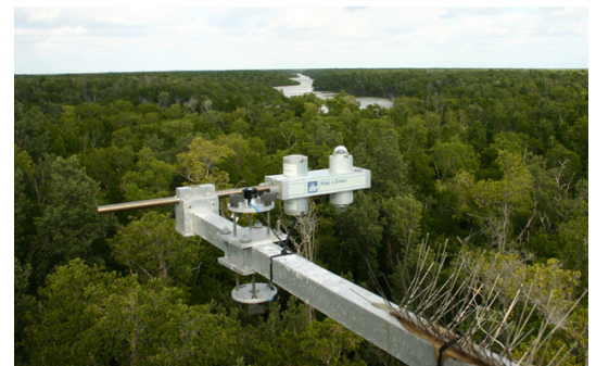
Tree-top CO 2 collection tower used to understand the complex relationship between our changing climate and the park’s mangrove swamps.

Through the Earth to Sky partnership between NASA and the NPS, interpreters at Everglades NP developed a climate change podcast addressing the work park scientists are conducting to understand how unique ecological systems, such as the mangrove swamps, help remove carbon dioxide from the atmosphere. To listen to this podcast, go to: http://www.earthtosky.org/blog.html