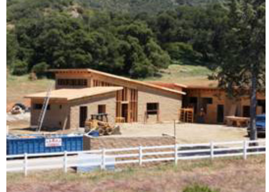
Intern Center under construction - April 2010.