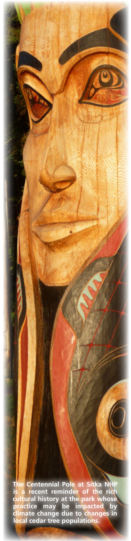
The Centennial Pole at Sitka NHP is a recent reminder of the rich cultural history at the park whose practice may be impacted by climate change due to changes in local cedar tree populations.