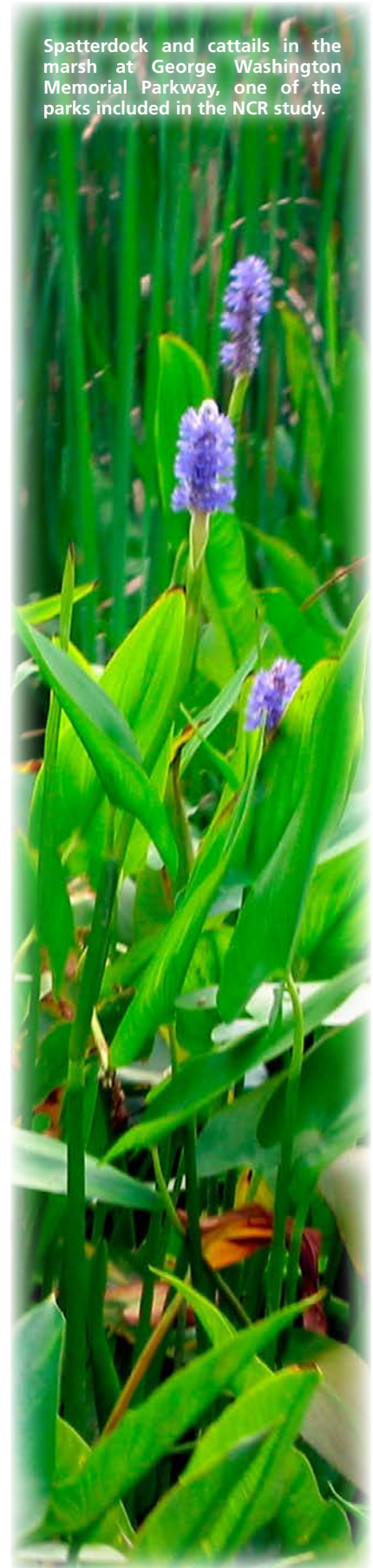
Spatterdock and cattails in the marsh at George Washington Memorial Parkway, one of the parks included in the NCR study.