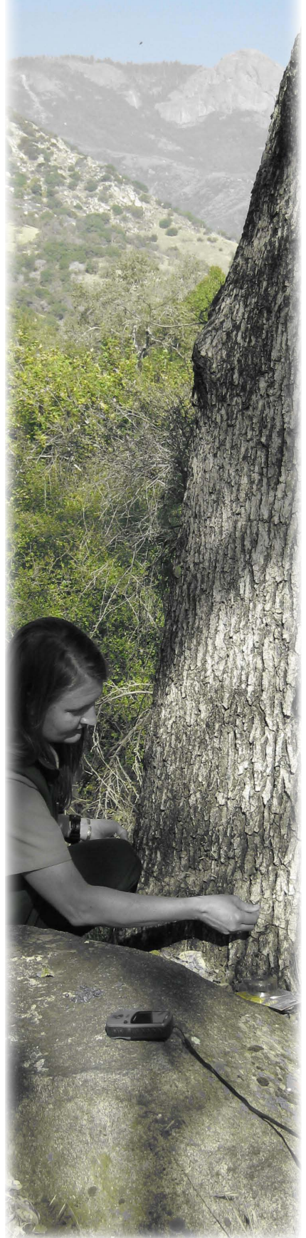
Conducting phenological monitoring at Sequoia and Kings Canyon National Parks.

Glaciers influence, and in many cases define, many components of the ecosystems in which they are found, and they are a central piece of the visitor experience. This study will not only provide valuable information on the status and recent trends of these glaciers to scientists, but will also inform decisions made by park managers about mitigation and adaptation efforts associated with climate change. In addition, it will assist interpreters in telling the complex stories of glaciers: their trends and their relationship to people and the environment. Contact: Bruce_Giffen@nps.gov