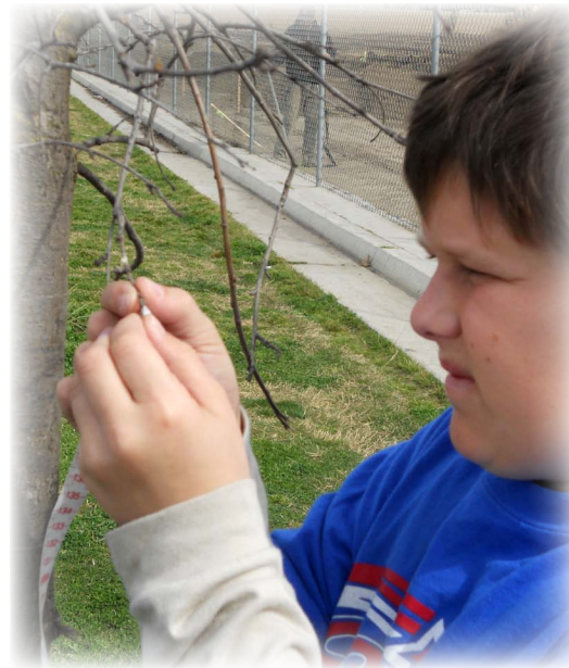
SPROUTS student measuring valley oak stems.