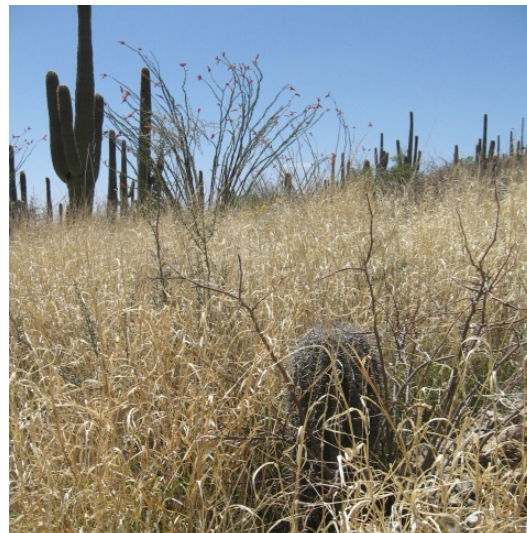
The native Saguaro Cacti is being choked out by invasive Buffelgrass.

On February 6th, Saguaro National Park participated in the annual Beat Back Buffelgrass Day. This event is a joint effort between park staff and hundreds of volunteers who remove thousands of Buffelgrass plants within the park and other public lands. Saguaro National Park was identified as one of 50 National Parks in peril due to threats of climate change (Rocky Mountain Climate Change Organization and Natural Resources Defense Council 2009) because of the threat of invasive buffelgrass. Buffelgrass, an introduced African grass threatens the icon species, the saguaro, directly by competition for resources and crowding out of native plant species. But more detrimental to the saguaro and Sonoran Desert ecosystem is fire; many of the Sonoran Desert species did not evolve with fire and will die as a result of burning. Buffelgrass fuels hotter, more intense and more frequent fires than historically known. Contact: Dana_Backer@nps.gov