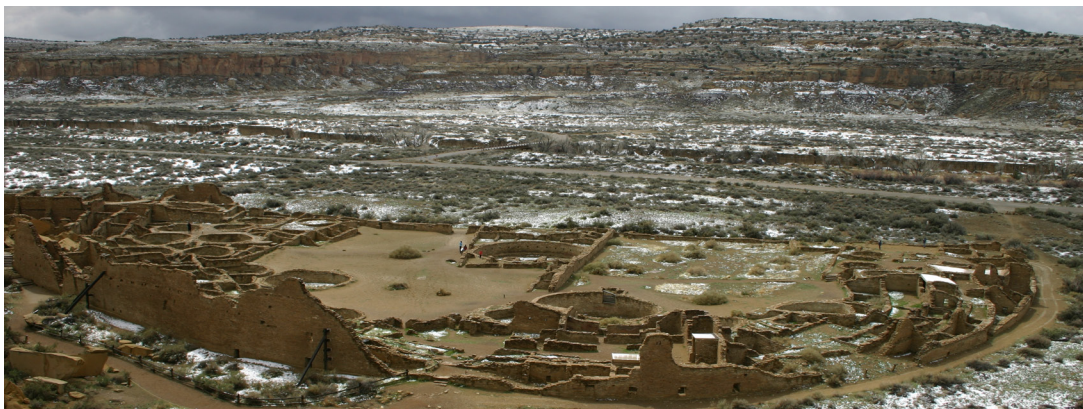
Pueblo Bonito with a light dusting of snow at Chaco Culture NHP.