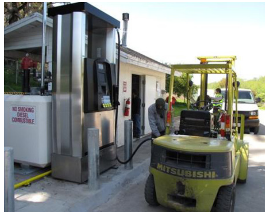
Eric DePaul, member of PORE Roads crew, fuels a forklift.

PORE plans to expand the biodiesel blending system to its road mowers, trails and ground maintenance