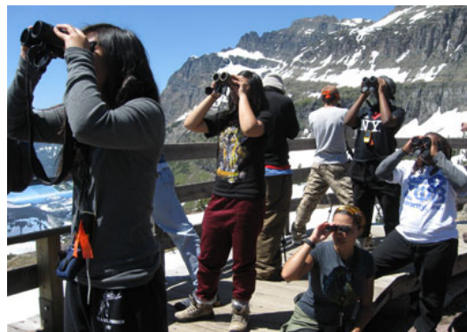
Climate Change Ambassadors Survey for Goats

The complete article on InsideNPS at: http://inside.nps.gov/index.cfm?handler=viewnpsnewsarticle&type=Announcements&id=9357