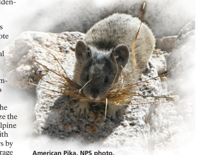
American Pika, NPS photo.

conditions. The study's hypothesis does not imply that climatic shifts will result in more restricted ranges but rather that some species could be unaffected or even benefit from climate shifts. It is just as likely, however, that some species will suffer adverse effects, as their distribution and behavior reflect adaptations to currently favorable habitat. Contact: Scott_Gediman@nps.gov , Or Niki_Nicholas@nps.gov