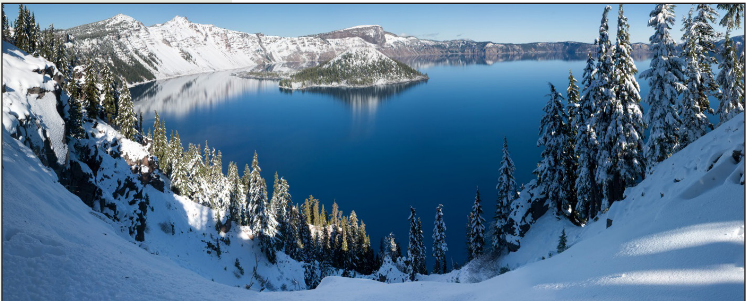
The timing of snowfall and subsequent melting relates directly to the timing of plant life cycles at Crater Lake National Park.

I am a Masters Candidate at Western Washington University in Bellingham, Washington. I am passionate about remote sensing, climate change research, and outdoor recreation. I find it energizing to see the Earth from new perspectives.