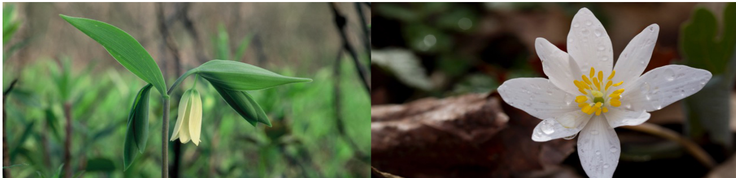
Leaves unfurling and blossoms opening in spring at Shenandoah National Park.