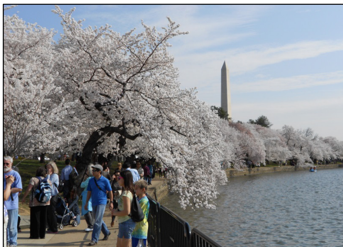
Visitors to the Cherry Blossom festival in Washington, DC. The timing of flowering is advancing with warming temperatures.

The National Park Service is beginning its second century of preserving America’s natural and cultural heritage and providing for visitor enjoyment. The coming decades are likely to see continuing changes in climate and phenology. Parks will need to adapt to both the challenges and opportunities posed by these changes.