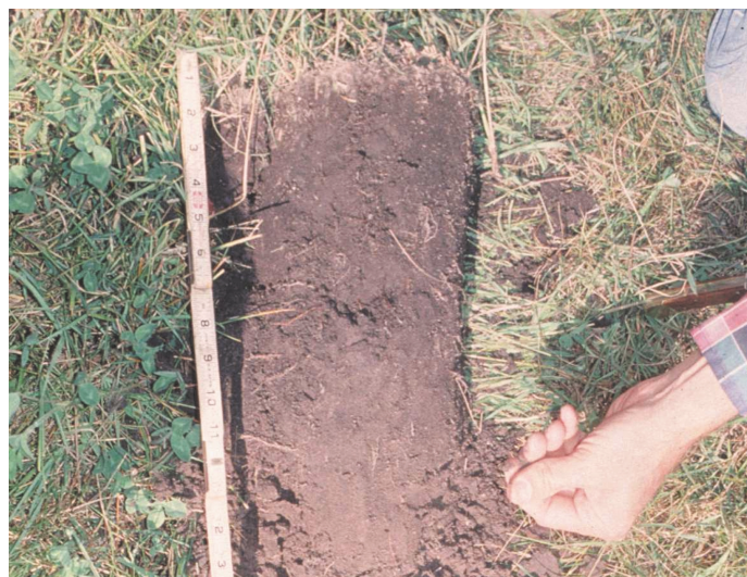
Organic matter darkens and stabilizes the surface layer in soils.