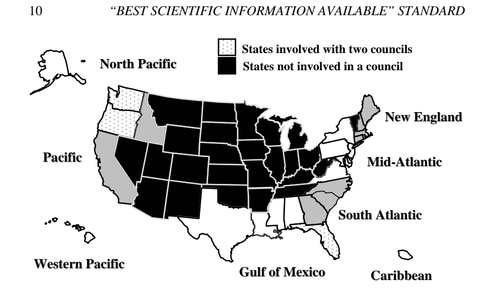
FIGURE 1.1 Map of the states and territories covered by the eight regional fishery management councils (used with permission from the National Oceanic and Atmospheric Administration).

Commerce, advised by NOAA Fisheries, must determine whether each FMP is in compliance with the 10 national standards contained in the Magnuson-Stevens Act as amended in 1996 (Box 1.1) prior to implementation.