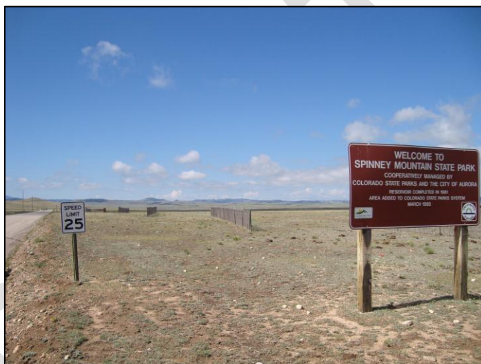
Photo showing landscape of Parcel #6488 at entrance to Spinney Mountain State Park

to visual resources if the parcels were to go into production. Impacts would most likely include moderate to weak contrasts in color and shape from the equipment as well as the associated roads and pads that would be mostly drowned out by the expansive view afforded to visitors utilizing the facilities at the State Park and meet the BLM Class III objectives. These impacts could be reduced through the use of appropriate colored equipment and careful use of topography in locating facilities, roads, and pads. The portions of parcel #6488 located within sections 14 and 24 are within or in close proximity to the State Park and mitigation measures would most likely still result in at least moderate to strong contrasts therefore a “No Surface Occupancy” stipulation was placed on these sections of the parcel to reduce impacts to the visual resources of the State Park. Two portions of the parcel are located on the side of Spinney Mountain directly above the reservoir and recreation facilities with minimal options for blending oil and gas production facilities, roads and pads. The portion of Parcel #6488 within section 14 is located directly adjacent to and in close proximity to the main entrance road with little options for blending and screening available.