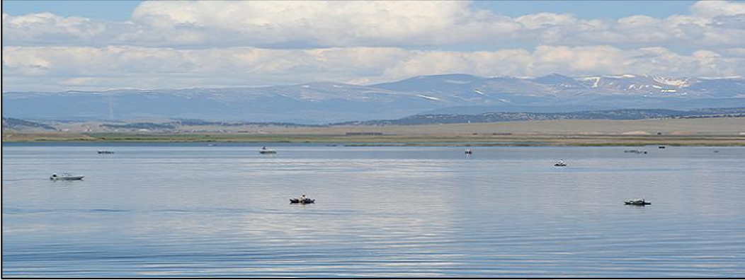
Photo from Colorado Parks and Wildlife website for Spinney Mountain State Park

Management activities may attract attention but should not dominate the view of the casual observer. Changes should repeat the basic elements found in the predominant natural features of the characteristic landscape.