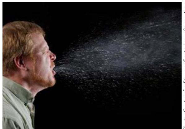
Airborne droplets visible during sneezing (photo enhanced).

Healthcare personnel who care for patients with ATDs must work in close proximity to the source of the hazard; even with controls in place, they are likely to have a higher risk of inhaling infectious aerosols (droplets and particles) than the general public. These personnel, and others with a higher risk of exposure related to the tasks they perform (e.g., lab or autopsy workers), must often be protected further through the proper use of