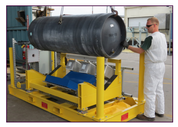
UCVS field prototype in action at the Westinghouse fuel fabrication facility in South Carolina.

In June 2015, representatives from DOE/NNSA, the IAEA, Euratom, several National Laboratories, and Westinghouse gathered at the fuel fabrication facility to assess the status of the field trial and accompanying analysis. For representatives from the IAEA and Euratom, the meeting provided the first opportunity to see the UCVS prototype in action and to hear feedback about the instrument from a facility operator.