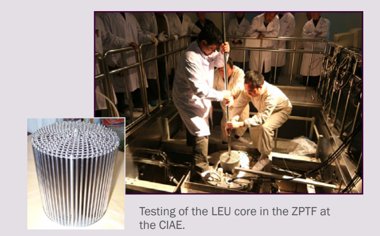
LEU core inserted into the Chinese MNSR at the CIAE.

Through Argonne National Laboratory, the United States participated in the CRP by providing input to a generic conversion analysis, which will serve as the safety basis for future MNSR conversions. The CRP participants established that China, or other fuel fabricators, will be able to produce LEU cores for the MNSR reactors and that conversion of the MNSRs is feasible. The IAEA expects to publish the findings of the CRP in 2015 as a Technical Report entitled