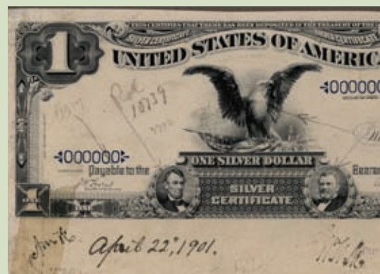
Vignette of 1880 Bureau of Engraving and Printing Building, 1901 (approved plate proof)