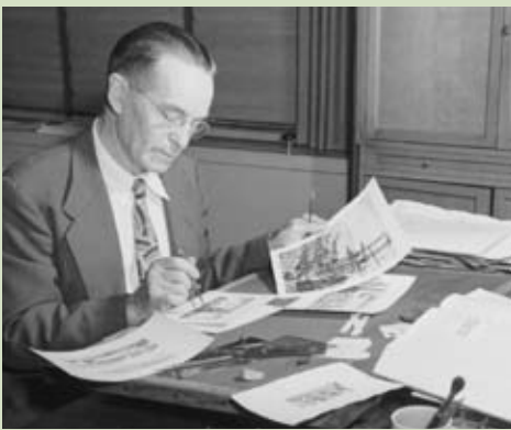
Bureau of Engraving and Printing, Annex building, 1939