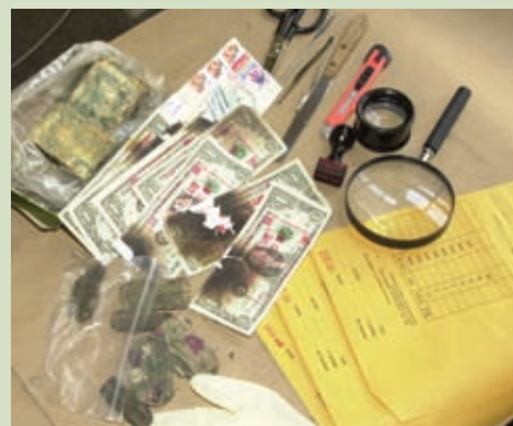
Examples of mutilated and damaged currency

What is not mutilated currency? Any badly soiled, dirty, defaced, disintegrated, limp, torn, or worn-out currency note that is clearly more than one-half of the original note, and does not require special examination to determine its value. These notes should be exchanged through your local bank.