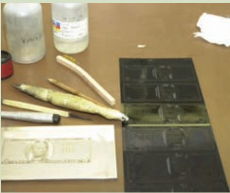
Currency plates, master die, and transfer roll