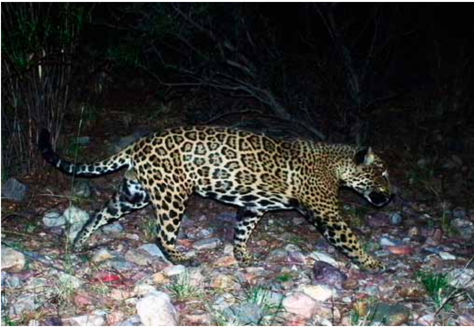
A male jaguar photographed by automatic wildlife cameras in Santa Rita Mountains in October 2013, as part of an ongoing jaguar survey conducted by the University of Arizona.

endangered species (for those species listed as threatened), nor decreased enough to warrant reclassification to a threatened species (for those species listed as endangered) or delisting.