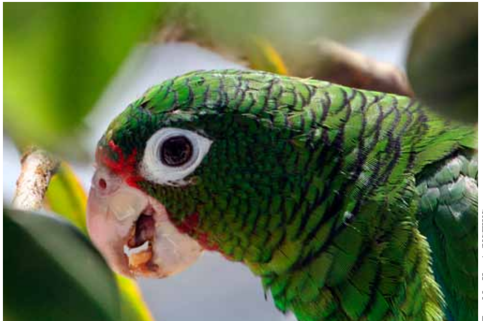
For the first time in 100 years, two endangered Puerto Rican parrots born in the wild fledged the nest successfully in 2014.