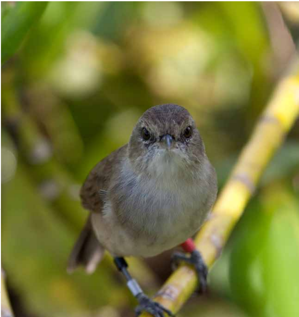
A June 2013 survey of endangered millerbirds on Hawai'i's Laysan Island found the bird's population more than doubled from the original total of 50 translocated birds released by partners in 2011 and 2012.

endangered species (E). At the close of this reporting period, the Service had lead responsibility for recovering 1,478 federally listed threatened species (307) and endangered species (1,171), 141 (24 threatened and 117 endangered) of which were listed during this 2-year reporting period.