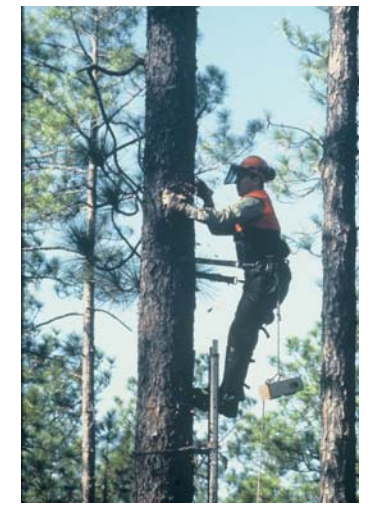
Installing an artificial nest cavity.

At present there are 18 Department of Defense (DoD) installations supporting RCWs. As of 2000, Eglin Air Force Base (FL) had 301 active clusters and Fort Bragg (NC) had 350 (only the Apalachicola Ranger District in Florida had more active clusters than Fort Bragg). All of these populations appear to be stable or increasing. Widespread declines among populations on military installations have been stabilized, but substantial increases in population sizes are still required for recovery. Early in the recovery phase of RCWs, the perception that military activities were a handicap to RCW conservation created tension between national defense requirements and endangered species management. However, RCWs have been shown to be more resilient to man's presence and activities than previously thought. The nature of livefire and mechanized training in pine forest lands by default fosters the savanna type conditions conducive to Studies have shown that RCWs.