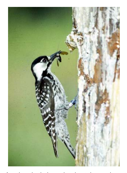
A red-cockaded woodpecker takes an insect back to its nest on Camp Lejeune.

cockade, which is rarely seen, is limited to a tiny patch of red feathers on the males located at the margin of the black cap and white cheek patch on each side of the head. The species evolved in the fire-maintained pine ecosystems of the Southeast, where RCWs emerged as the only bird species able to benefit from these living pines for nest cavities. Although they may forage on pines from pole size to mature trees, only the oldest trees become cavity trees. As the trees age, they become susceptible to fungi that work to soften the inner heartwood. RCWs are able to detect these weakened trees and select them for use as cavity Once they penetrate the outer trees. sapwood, the softened heartwood is gradually sculpted into a cavity, although this may take several months to a decade or more to complete. Coincident with this, the exposed