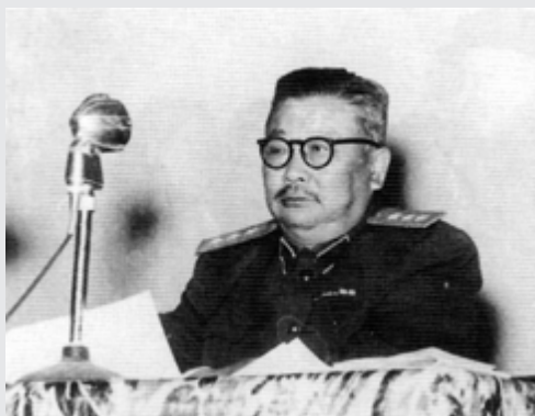
Li Kenong, the People's Republic of China's most senior intelligence official from 1949 until his death in 1962.