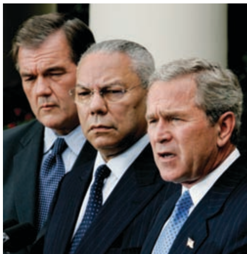
On 2 August 2004, President Bush told a Rose Garden press conference that his administration endorsed establishment of a DNI.

The experience of Britain's Security Service (MI-5) also influenced the NCTC model. MI-5 is actually a relatively small agency that—bridging foreign and domestic work in counterterrorism—gains much of its strength from pooling expertise and orchestrating relevant activities of other executive agencies, like police forces and the Secret Intelligence Service (MI-6).