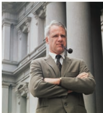
James Schlesinger, as deputy director of Office of Management, floated the idea of creating a director of national intelligence in 1971.

As in 1961, two recurrent concerns animated this reform proposal. One was substantive: a Pentagon-centered approach tended to be more parochial, less objective