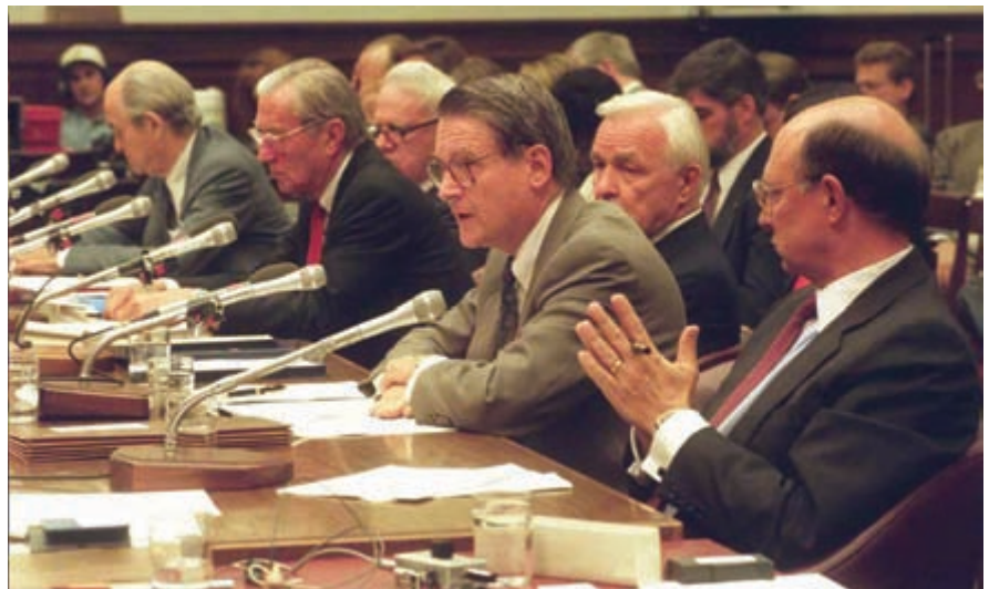
Six former DCI’s in May 1995 appeared before the House Select Intelligence Committee, whose report in 1996 proposed separation of the DCI from CIA’s management, among other major recommendations.

Aspin-Brown declined to quarrel over the key DoD powers. Its report promised not “to alter the fundamen-