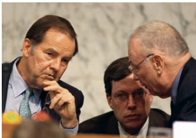
9/11 Commission Chairman Kean (l), Vice Chairman Hamilton (r), and author discussing testimony on 13 April 2004.

This was true for the creation of several of the major institutions created in the 1940s and 1950s, like the Joint Chiefs of Staff and the Office of Special Services. It was true again.