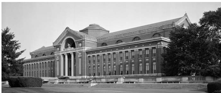
The National War College was established in 1946. Its earliest faculty included George F. Kennan and Sherman Kent, both strategic thinkers.

If any one of these “means” is insufficient, the strategy will struggle. Note that in this formula “ends” actually come first. Before engaging any strategy, before making any plans, or thinking about resources, one must know clearly what the goal is. If one cannot clearly articulate this to the first 10 people one encounters in a shopping mall or baseball game, that person needs to go back to the drawing board and figure out what exactly he or she is trying to achieve strategically.