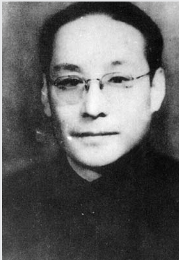
Pan Hannian, ca. 1950s.

Thirdly, Pan had overseen postwar counterintelligence operations in Shanghai that had deployed pre-1949 defectors from the Kuomintang as double agents, and he had directed deception operations with