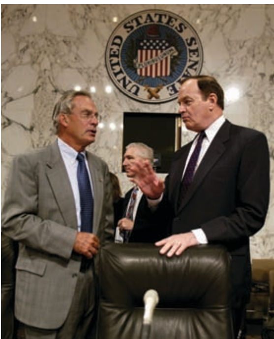
Porter Goss and Richard Shelby, chairs, respectively, of the House and Senate intelligence committees, confer before opening on 18 September 2002 of the Congressional Joint Inquiry into the events of 9/11.

(alerting to possible flight school activity by potential hijackers, though I think this episode is exaggerated a bit by hindsight). The JI was not able to pursue some of the leads it uncovered, some fruitful some not, to firmly evidenced conclusions. The 9/11 Commission was later able to stand on the shoulders of the JI's original work and excellent work done by a CIA analytic team as well as the very thorough FBI "PENTTBOM" investigation—the shorthand name of FBI's investigation of 9/11.