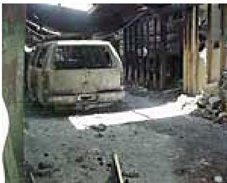
Utility vehicle inside the facility.

The SMART-Radars, mobile C-band doppler radars mounted on a truck, were near completion and scheduled to be used to