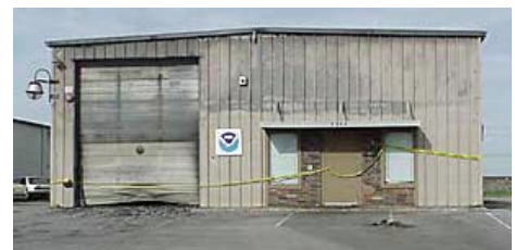
NSSL's equipment storage facility after the fire.