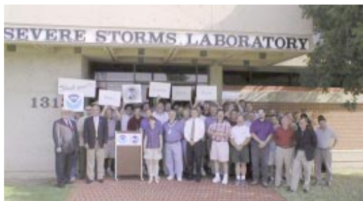
NSSL, CIMMS, and OU staff show their appreciation by saying "Thank You" to NOAA management for their quick response.