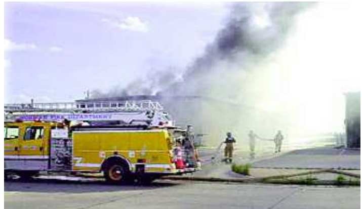
Fire fighters work to put out the fire at NSSL's equipment storage facility.

The complete story and more pictures can be found at: http://www.nssl.noaa.gov/headlines/fire.html . ♦