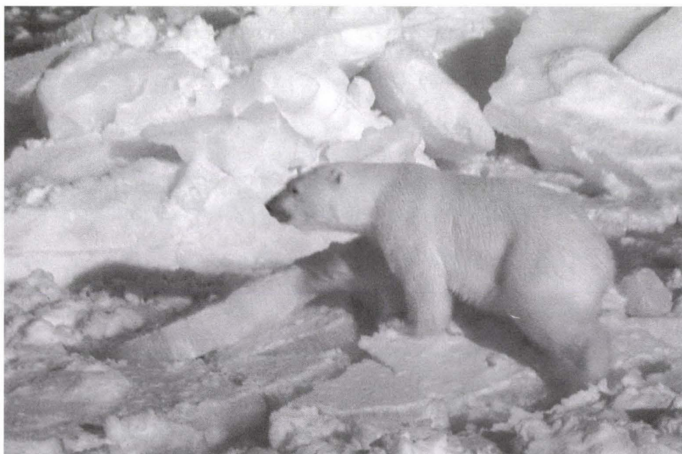
A polar bear on ice in Alaska.

■ Published work includes: (1) Survival of female polar bears and their dependent young; (2) Population delineation of polar bears in Canada using satellite data; (3) Documentation of the movements of a polar bear from northern Alaska to Greenland; and (4) A general description of polar bear status and research in Alaska. A manuscript on movements and distribution of polar bears in the