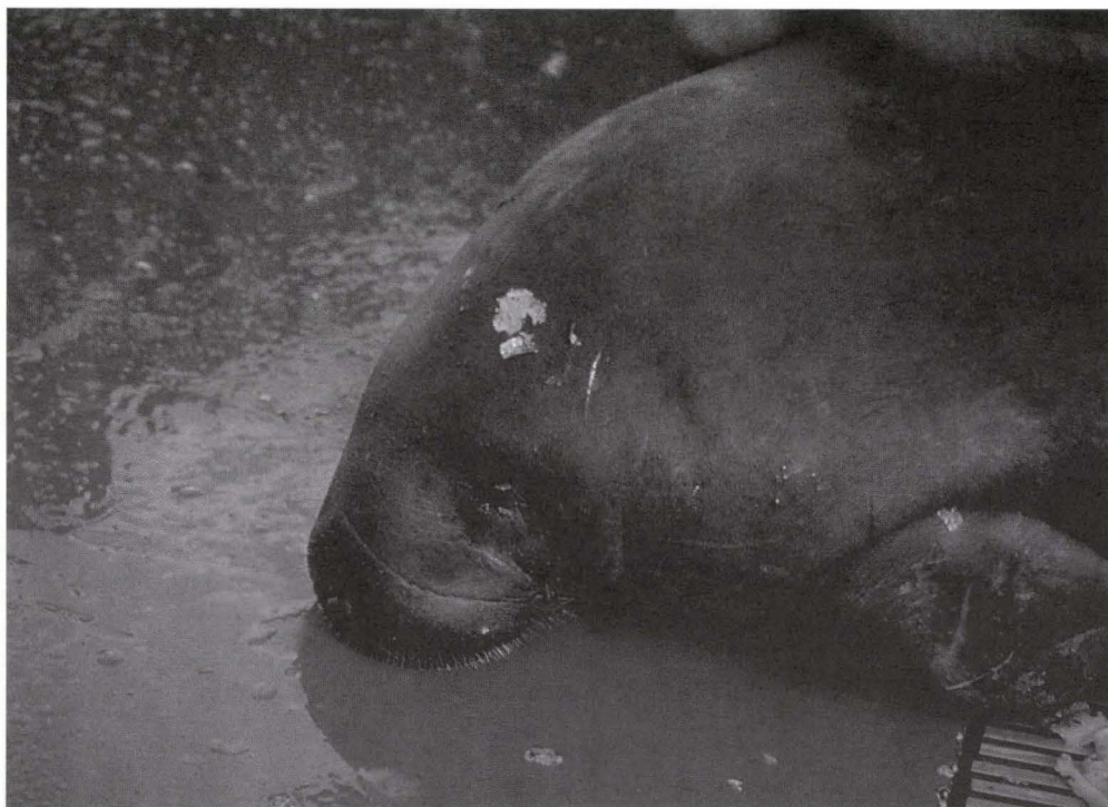
Chessie awaiting his release from Sea World of Florida.