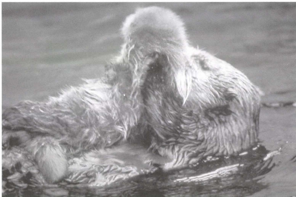
A female northern sea otter with her pup in Alaska.

■ USGS/BRD studies at Amchitka Island have shown that whereas sea otter populations normally are maintained by coastal production, these food webs are occasionally massively subsidized from the oceanic realm in the form of inshore spawning migrations of smooth lumpsuckers. These episodic food subsidies appear to release the otter populations from food limitation, thus altering both their foraging behavior and demography.