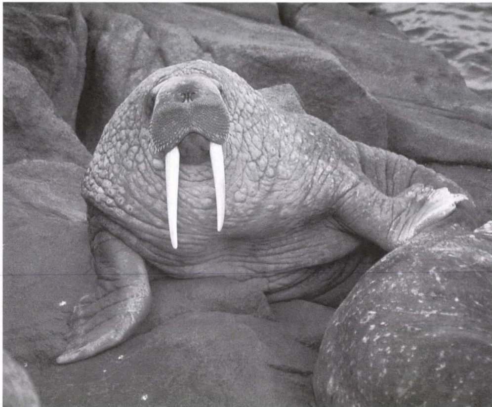
A male Pacific walrus on Round Island Alaska.

Section 104 of the Act authorizes the Director of the Service, acting on behalf of the Secretary of the Interior, to issue permits for the activities identified above. Applicable provisions are found in Title 50 of the Code of Federal Regulations — 50 CFR 18.23(d) for registered agent/tannery permits and 50 CFR 18.31 for scientific research or public display permits. During 1996 the Service worked toward finalizing the regulations proposed in 1995, to establish application procedures and make legal and scientific findings to allow for the issuance of permits under section