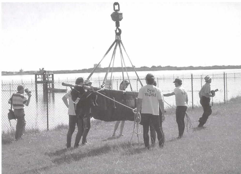
A manatee transfer at the soft release pens in the Banana River at the Merritt Island National Wildlife Refuge, Florida.

More than 20 years of manatee research and management initiatives have shown that the manatee's future depends upon a better understanding of its status and life history, and on better protecting the manatee and its habitat from direct and indirect impacts. The protection of these essential components in the face of an increasing human population, development, and use of water craft underscores the need to continue to balance the needs of the manatee with its human neighbors.