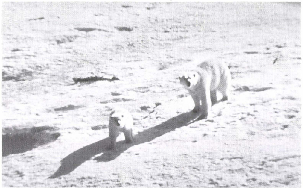
A female polar bear with cub in Alaska.

Discussions continue between officials of both countries to develop a conservation agreement. The primary purpose of a bilateral agreement would be to provide for effective conservation and management of the polar bear population in the Chukchi/Bering Seas through regulation of take and conservation of habitat. The Service prepared a draft Environmental Assessment (EA) regarding this proposal. On July 19, 1996, the Service published a FEDERAL REGISTER notice of public availability of the draft EA and 60-day comment period on the environmental effects of a proposed U.S./Russia Bilateral Polar Bear Treaty (61 FR 37761). Two public meetings were held to promote discussion on the draft EA, one on August 14, 1996, in Anchorage and the other on August 21, 1996, in Washington D.C. In addition, public meetings were held in the coastal