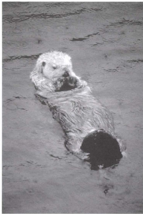
A northern sea otter in Alaska.

Recognizing the importance of marine mammals as resources for subsistence, and materials for handicrafts made by Alaskan Natives, the 1994 amendments to the Act included provisions for funding cooperative management measures for these species. Native organizations, Federal agencies, and State agencies are developing cooperative management agreements and plans to guide future resource management practices, with the goal of increasing involvement of Alaskan Natives in the development of