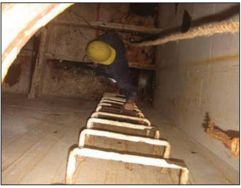
Photograph shows an employee entering a confined space.