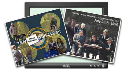
ADA Streaming Videos

addresses the importance and value of doing business with people who have disabilities. The ADA Signing Ceremony documents the speech given by President George H. W. Bush when he signed the ADA into law on July 26, 1990. Links to these two videos are available online at www.ada.gov .