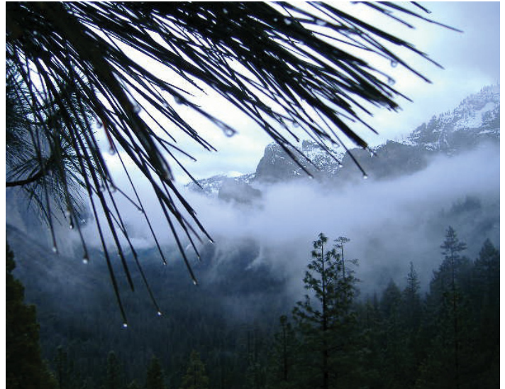
Yosemite Valley after the rain

Park interpretive staff have the opportunity to introduce the issue of climate change to many visitors. Yosemite NP encourages staff to include messages about climate change in their visitor talks as well as monthly climate change presentations by Yosemite Institute for