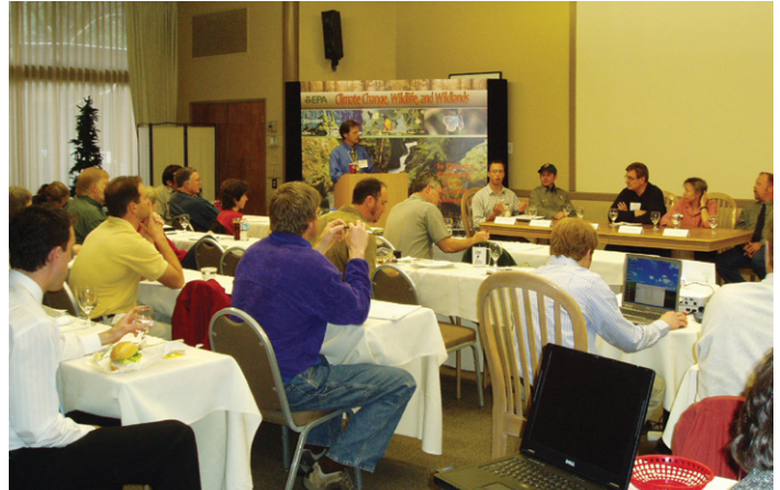
Participants at Yosemite NP's CFP Workshop

Replacing one incandescent light bulb with an energy-saving compact fluorescent bulb means 1,000 pounds less carbon dioxide is emitted to the atmosphere and $67 dollars is saved on energy costs over the bulb's lifetime. ( U.S. Environmental Protection Agency and Alliance to Save Energy )