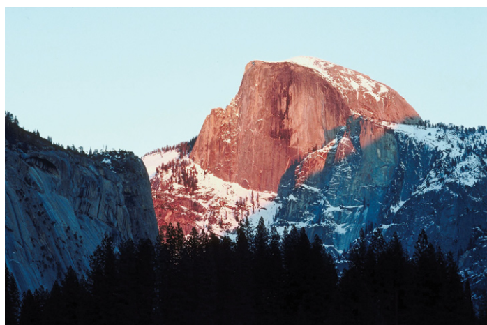
Sunset at Halfdome

Reducing greenhouse gas emissions has many local benefits other than protecting our climate. One example of these co-benefits is improved ambient air quality. The Yosemite Valley tends to trap local air pollutants such as particulates and create concentrated levels of criteria air pollutants. The same activities that generate greenhouse gases also generate criteria air pollutants. Therefore, by addressing these activities, greenhouse gas and criteria air pollutant emissions can be addressed simultaneously.