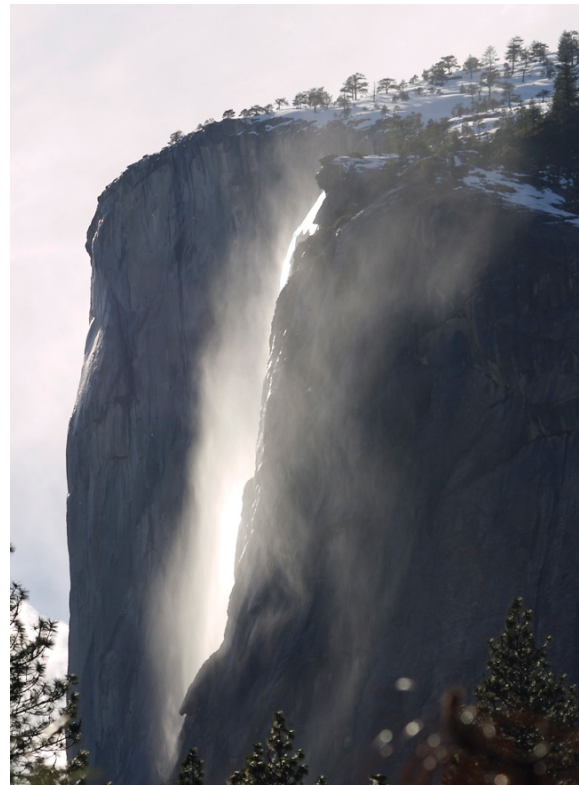
Yosemite NP waterfall during snowmelt

The continued addition of CO 2 and other greenhouse gases to the atmosphere will raise the Earth's average temperature more rapidly in the next century; a global average warming of 4-7°F by the year 2100 is considered likely. Rising global temperatures will further raise sea level and affect all aspects of the water cycle, including snow cover, mountain glaciers, timing of spring runoff, water temperature and aquatic life. Climate change is also expected to affect human health, alter crop production, animal habitats, and many other features of our natural and managed environments.