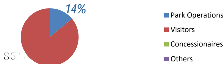
Haleakalā National Park 2008 Total Emissions by Park Unit