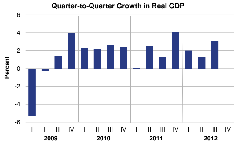
Real GDP growth is measured at seasonally adjusted annual rates.

In contrast, business investment turned up, as spending on equipment and software rebounded (mainly computers and related parts as well as transportation equipment). Consumer spending also picked up (mainly financial services as well as autos and parts).