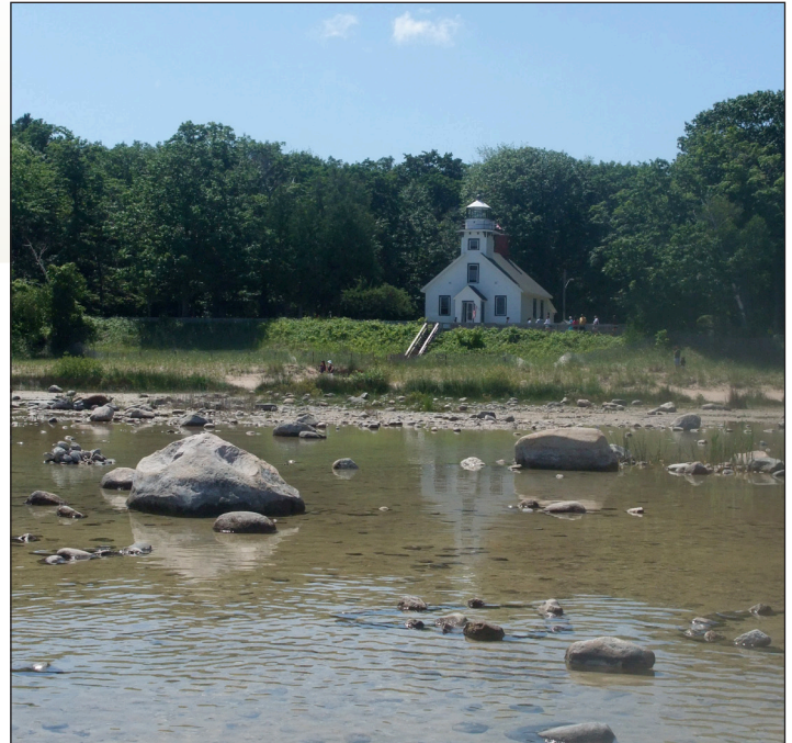
Old Mission Point Lighthouse, Grand Traverse Bay, Lake Michigan in July 2010.

The Center for Operational Oceanographic Products and Services (CO-OPS), part of NOAA's National Ocean Service (NOS), operates water level and meteorological monitoring stations for the ocean and Great Lakes coasts. Historic records for some of these stations date back to 1860, providing over 150 years of continuous data. The Canadian Hydrographic Service also maintains water level monitoring stations on the Great Lakes and St. Lawrence River. This water level and meteorological information network is used by a diverse group including recreational boaters, the commercial shipping industry, hydropower companies, and government agencies.