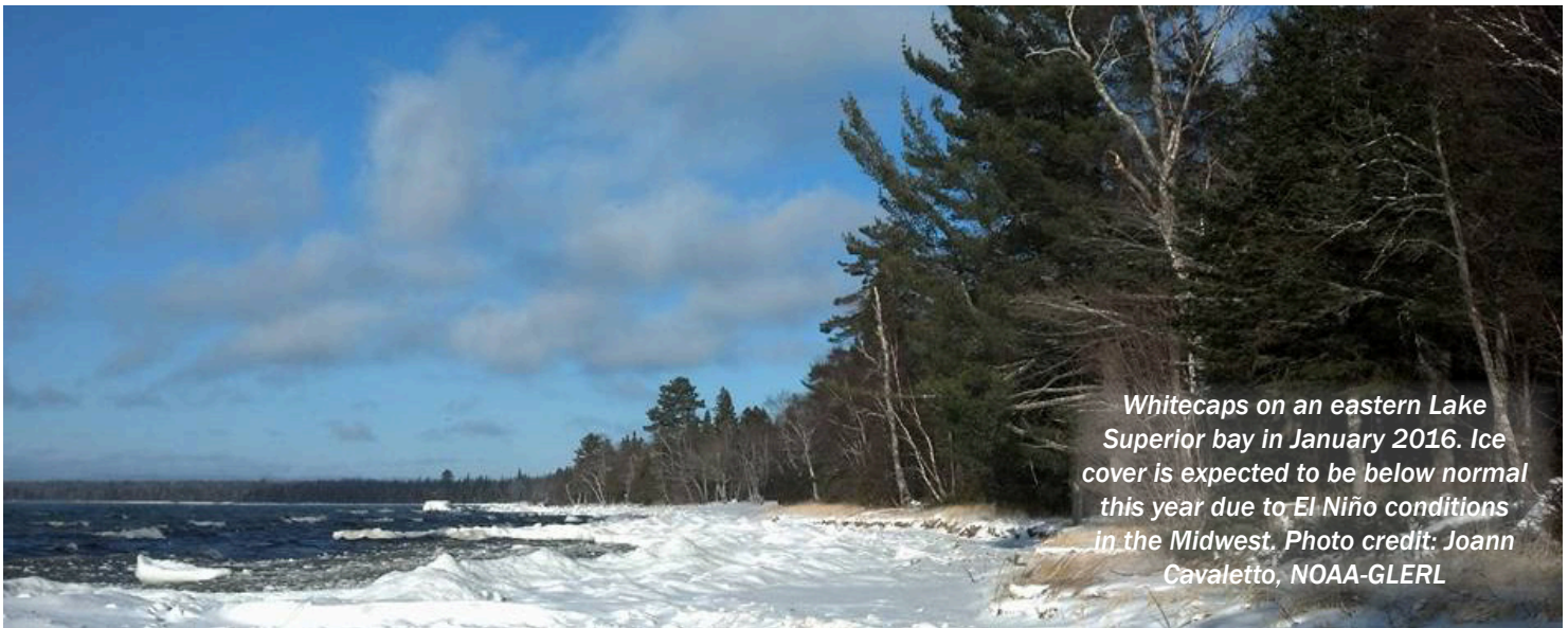
Whitecaps on an eastern Lake Superior bay in January 2016. Ice cover is expected to be below normal this year due to El Niño conditions in the Midwest.

The El Niño that is impacting weather in the midwest and northeast this winter is also showing signs of impacting Great Lakes water levels. An El Niño develops when the sea surface temperatures in the equatorial Pacific Ocean are warmer than average. Typically, this means the polar jet stream stays farther north, producing warmer and drier conditions in the Great Lakes basin.