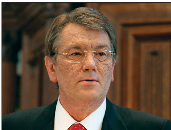
Former Ukrainian President Viktor Yushchenko was intentionally poisoned with dioxin, resulting in facial scarring.

The dioxin TCDD, or 2,3,7,8-tetrachlorodibenzo-p-dioxin, is a known cancer-causing agent, 4 and other DLCs are known to cause cancer in laboratory animals. Additionally, dioxin exposure has been linked to a number of other diseases, including type 2 diabetes, ischemic heart disease, and an acne-like skin disease called chloracne, a hallmark of dioxin exposure.