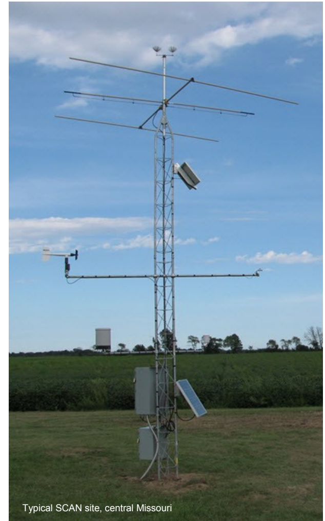
Typical SCAN site, central Missouri

USDA is an equal opportunity provider and employer. NWCC 6/22/2016