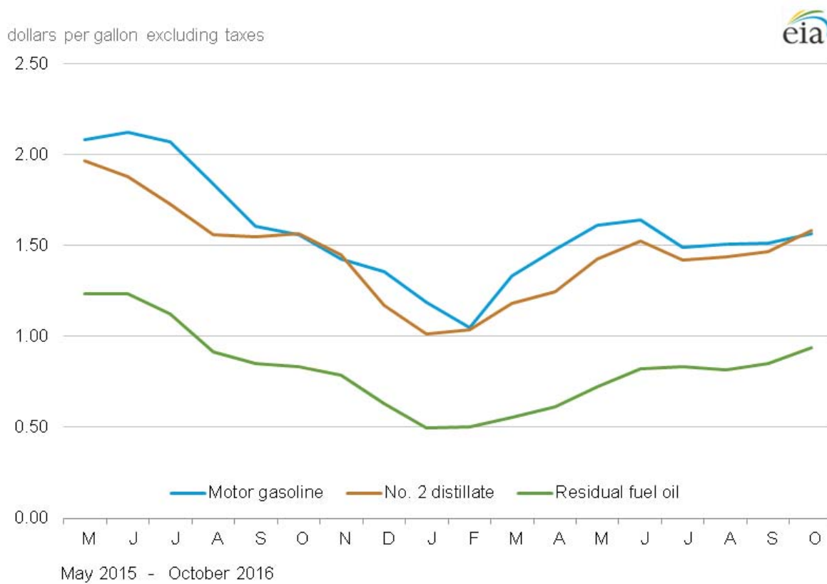
Figure 4. U.S. Refiner wholesale petroleum product prices