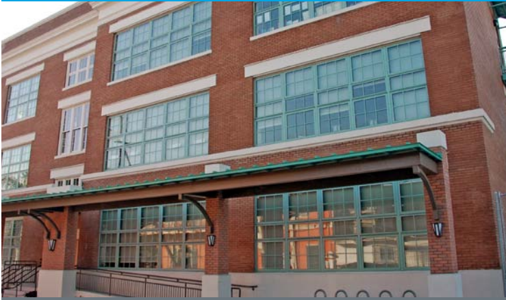
Joseph A. Craig Elementary School opened in 1927 and was renovated following Hurricane Katrina to primarily bring the electrical, mechanical, and plumbing systems up to current codes and standards.

Joseph A. Craig Elementary School (Craig) , located in the historic Treme neighborhood, opened in 1927 as the first new school in New Orleans built for African American children. In 2007, an environmental assessment identified a leaking roof and extensive mold. Since Craig was not a Quick Start School, its renovation was put on a fast track and planners didn't include any energy efficiency goals in their renovation plans.