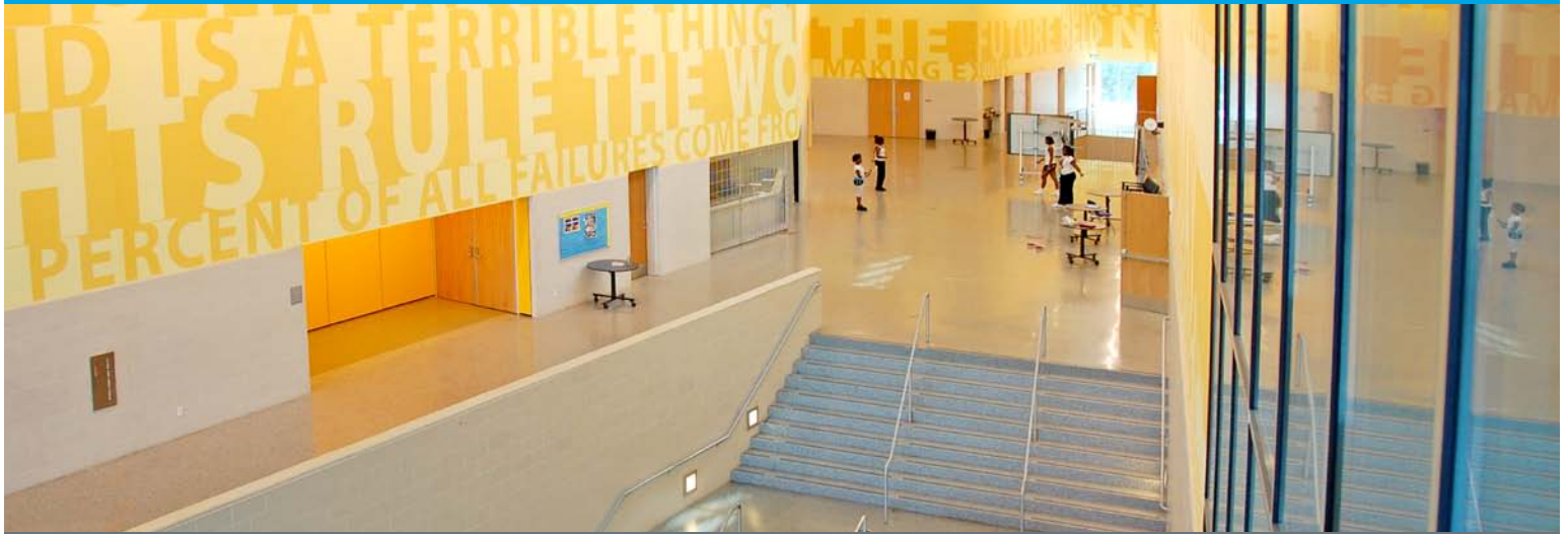
L.B. Landry High School corridor.