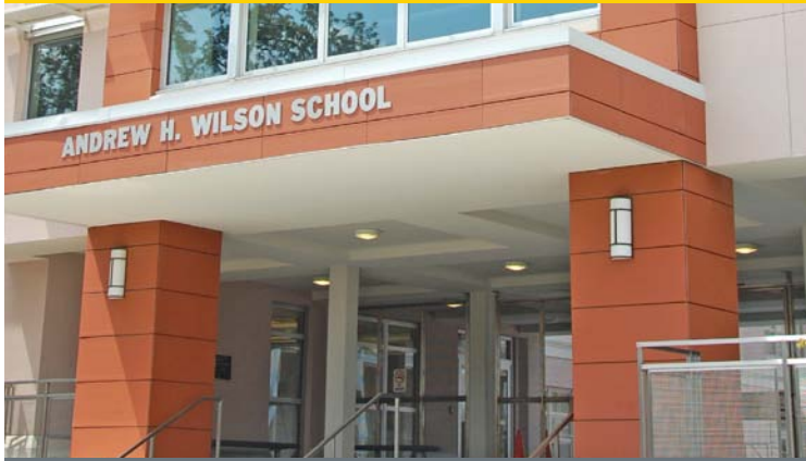
Andrew H. Wilson Elementary School, built in 1909, underwent a major renovation following Hurricane Katrina after suffering major flooding and wind damage. In addition to renovating the existing building, the school doubled its square footage and added both photovoltaic and solar hot water systems.