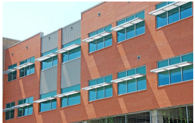
The majority of classrooms at Lake Area High School utilize daylighting thanks to the use of exterior shading and semi-transparent daylight glazing on the upper half of south-facing windows.

The experiences of incorporating energy efficiency after Hurricanes Katrina Rita in four new schools— Langston Hughes Elementary School, Andrew H. Wilson Elementary