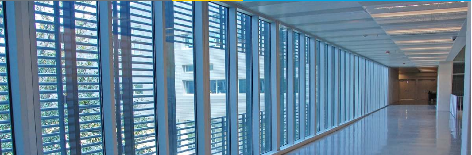
Good daylighting, as shown in the second-floor hallway at L.B. Landry High School, can have numerous benefits, including improving student performance on math and reading tests.