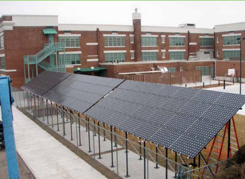
Craig Elementary School, located in New Orleans, installed one of the largest solar systems in the city.