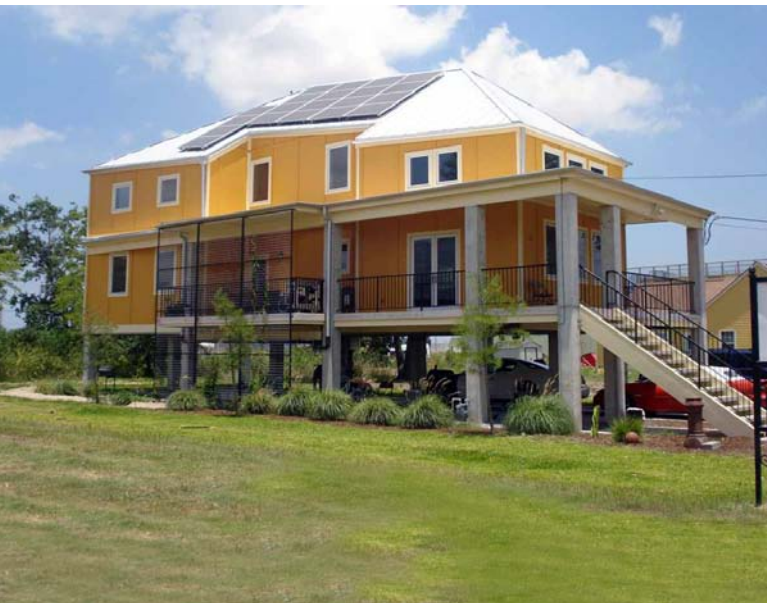
A Lower Ninth Ward home is rebuilt through Brad Pitt’s Make It Right Foundation.