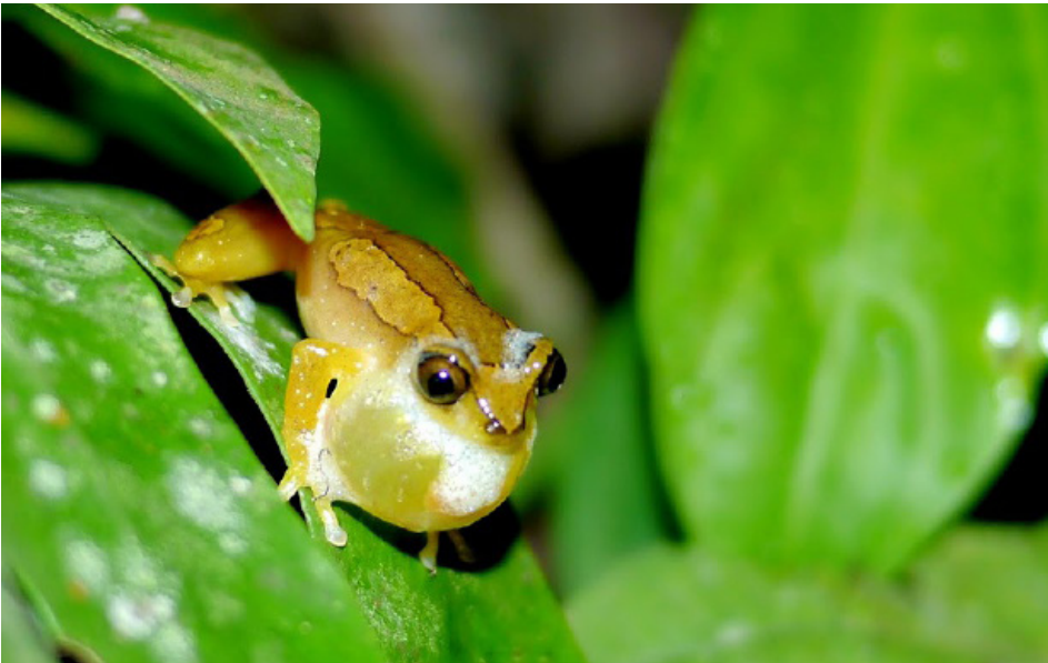
The frog species Afrivalus paradorsalis sits on a leaf in a forest in Equatorial Guinea.

Home to the fourth highest species richness of primates in Africa including many endemic subspecies.