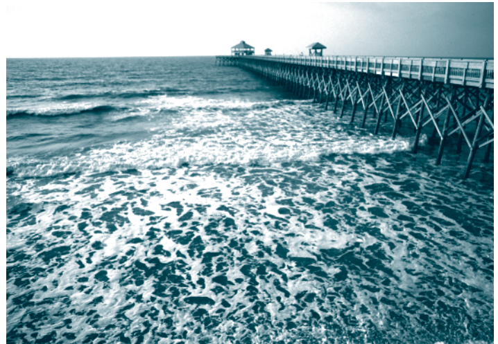
Edwin S. Taylor Fishing Pier at Folly Beach, South Carolina

In 2006, South Atlantic commercial fishermen received $141 million for their harvest (116 million pounds). The ex-vessel value of shellfish landings (64 million pounds) was $80 million with shrimp and blue crab accounting for 47% of total landings revenue. Landings of finfish and other fishery products (52 million pounds) had an ex-vessel value of $61 million. The commercial fishing industry had the highest sales, income, and employment impacts in Florida (note that this is the entire state, not eastern Florida): $5.2 billion in sales, $2.9 billion in income, and 103,000 jobs.